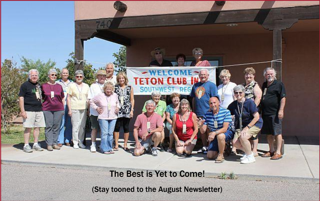
The Best is Yet to Come! (Stay tuned to the August Newsletter)